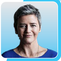
Margrethe Vestager Executive Vice President, A Europe Fit for the Digital Age, European Commission