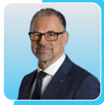
Josef Aschbacher Director General, European Space Agency (ESA)