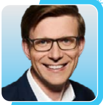
Martin Kupka Minister of Transport, Czech Republic