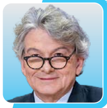
Thierry Breton Commissioner, Internal Market, European Commission