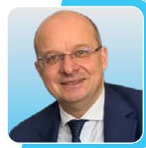
Christophe Grudr Rapporteur on the EU Secure Connectivity Initiative, European Parliament