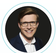
Martin Kupka, Minister of Transport of the Czech Republic