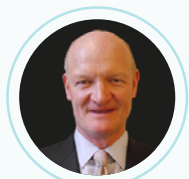
David Willetts, Chairman, UK Space Agency