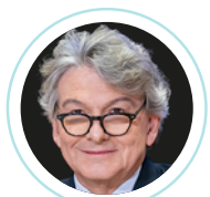
Thierry Breton, Commissioner, Internal Market, European Commission