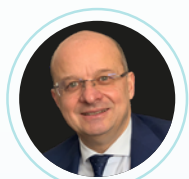
Christophe Grudler, MEP, European Parliament