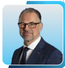
Josef Aschbacher Director General, European Space Agency (ESA)