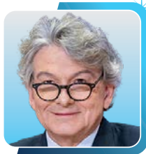
Thierry Breton Commissioner, Internal Market, European Commission