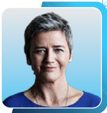
Margrethe Vestager Executive Vice President, A Europe Fit for the Digital Age, European Commission