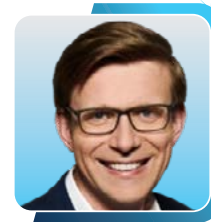
Martin Kupka Minister of Transport, Czech Republic